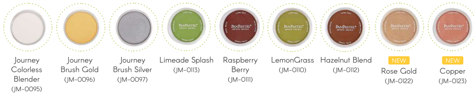
Journey Colorless Blender (JM-0095)

In addition to these color rich combinations, we offer NINE add-on options: